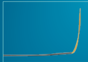
Figure : 90°angle between Loop and Shaft